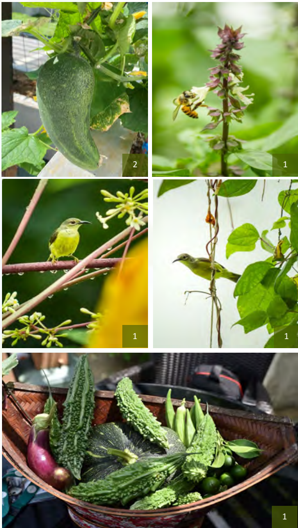
TOP CLUSTER: Harvested vegetables and biodiversity found in the rooftop garden