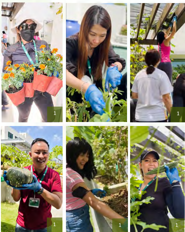
BOTTOM CLUSTER: Staff harvesting, weeding and helping with plant replacement during INSEAD's Gardeners' Day Out.