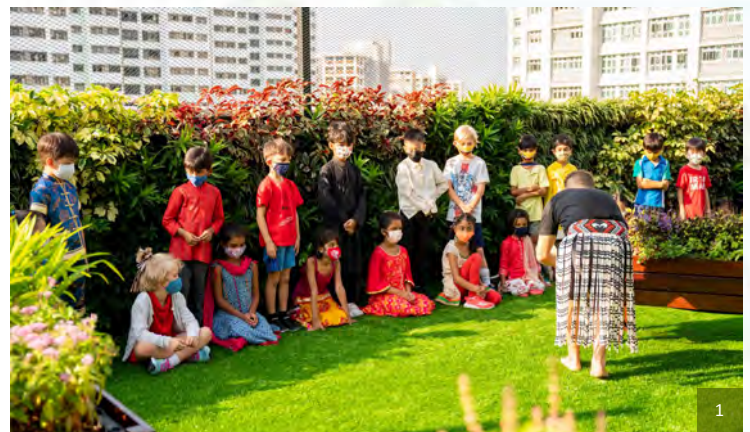
BOTTOM ROW: Class photo of children in heritage wear during annual UWC day celebrated globally on 21 September which coincides with UN International Day of Peace. UWC Day is a moment to celebrate the strength and diversity of the UWC movement and the school's mission for a more peaceful and sustainable future.