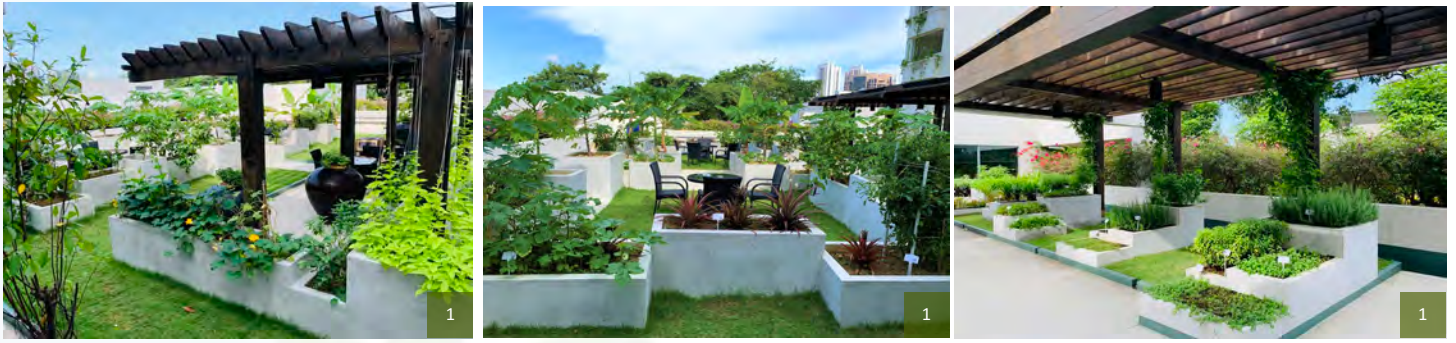
MIDDLE ROW: INSEAD 's newly installed green walls