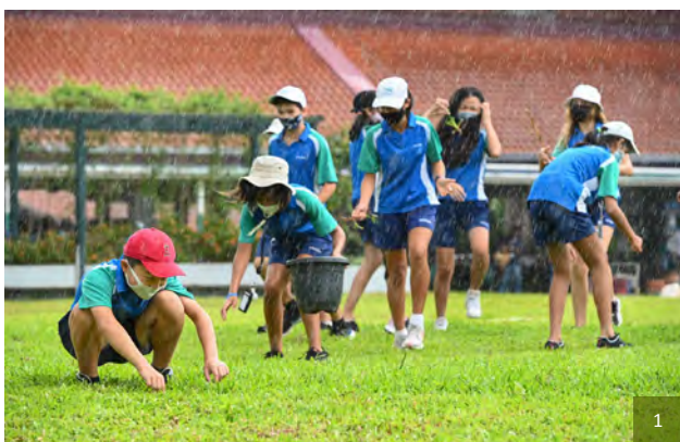
BELOW PHOTOS: UWCSEA students getting involved with the maintenance of rooftop garden by weeding.

In line with UWCSEA’s own long-running Rainforest Restoration Project, Dr. Van Breugel designed an experiment to examine the responses of tree seedlings with various characteristics to different light levels to help guide species selection for reforestation programmes across the region. After a period of being home to other projects, we decided to actualize our idea of GreenHeart at the concrete space in year 2020 and transform UWCSEA’s student-led Rainforest Reforestation Project nursery into an actual living outdoor classroom for students across campus to continue their student-led educational journey.